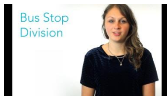
Bus stop method

Your child has chosen their homework questions and these are an extension of the work completed earlier this week. Please could you work with them to support with their chosen methods? The two methods introduced were the 'bus stop method' and the 'partitioning method'. Links to video clips that demonstrate these methods can be found below;